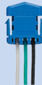
Wire relief slots: Easier to push into electrical box.