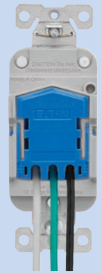
Arrow design: Ensures safe and correct installation.

Choose Arrow Hart EZ Link modular devices for efficient and reliable wiring solutions in commercial applications.