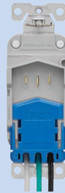
Sliding installation: Faster and easier connection.

Arrow Hart EZ Link modular devices are designed with electrical contractors in mind, helping meet deadlines and save on labor costs.