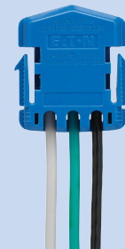
Wire relief slots: Easier to push into electrical box.