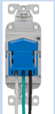
Arrow design: Ensures safe and correct installation.

Choose Arrow Hart EZ Link modular devices for efficient and reliable wiring solutions in commercial applications.